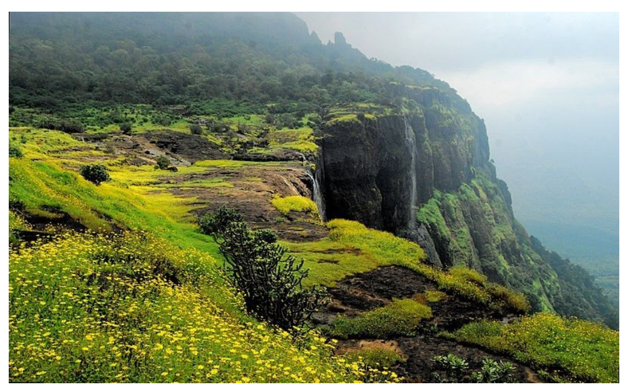
Frequently asked questions for Naneghat Trek